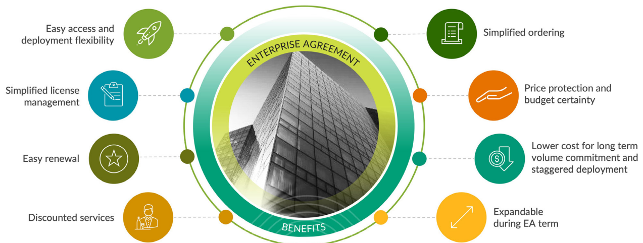
Figure 1: Juniper Enterprise Agreement Benefits

The Juniper Enterprise Agreement includes many benefits (Figure 1) that are not included in standard purchase agreements. Table 1 maps key Juniper Enterprise Agreement outcomes to those benefits.